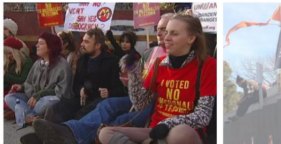
Anti McDonalds protesters vow to keep up their demonstration