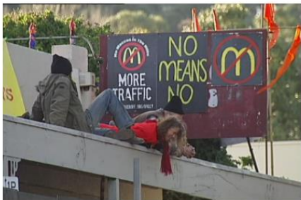
Work is already on the way at the site of a new McDonalds, but locals say they will continue to their fight to stop the American chain from building in their town. (ABC TV)